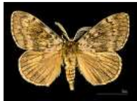
Spongy Moth Male