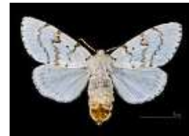
Spongy Moth Female